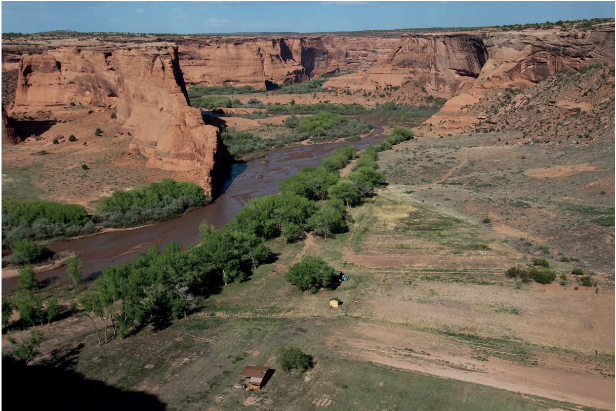
A stream and some desert landforms in the Canyon de Chelly, Arizona, USA