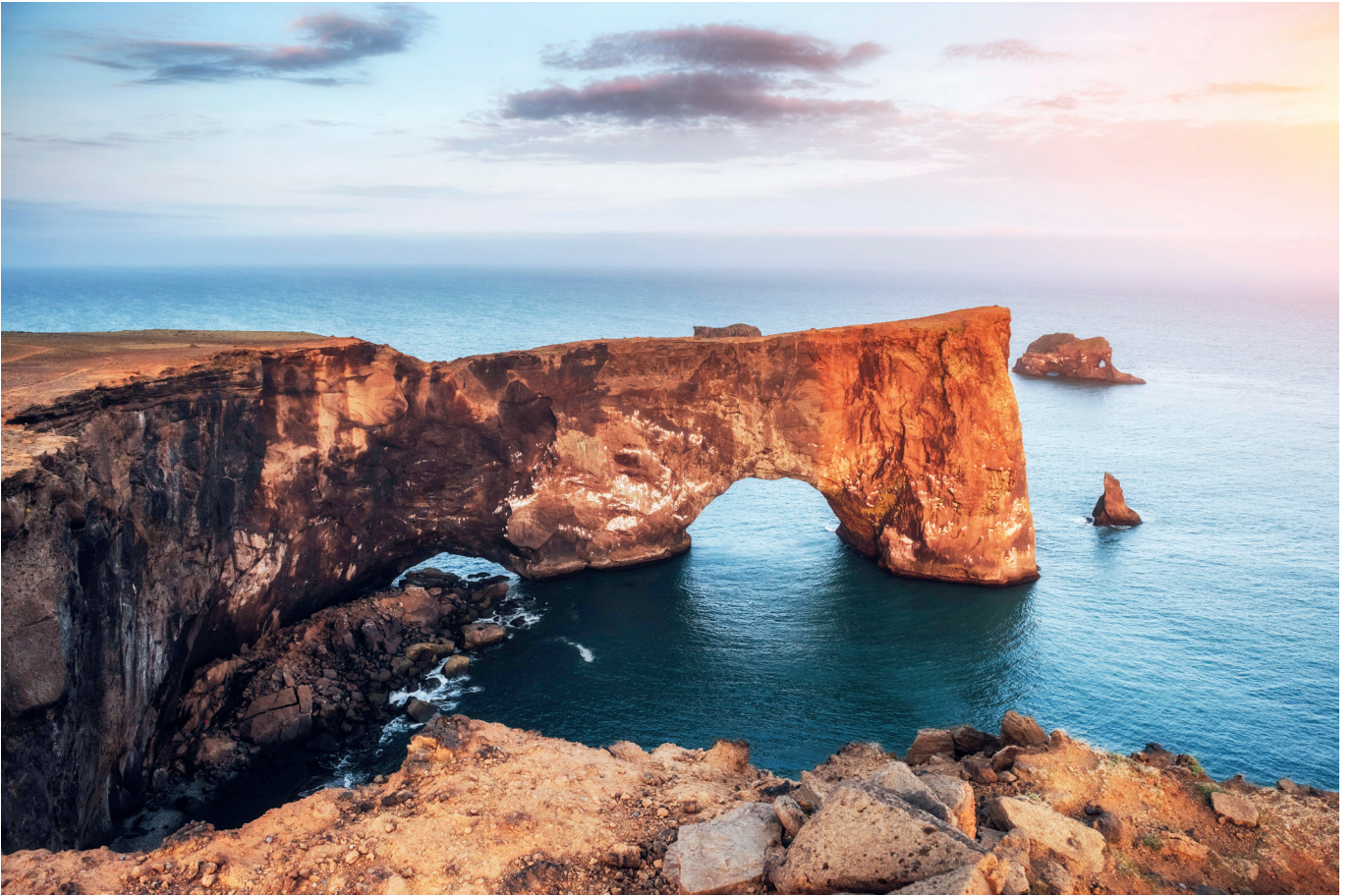
Some coastal landforms