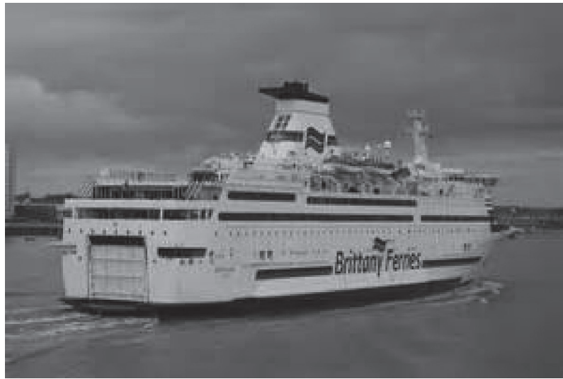
Fig. 3 for Question 3