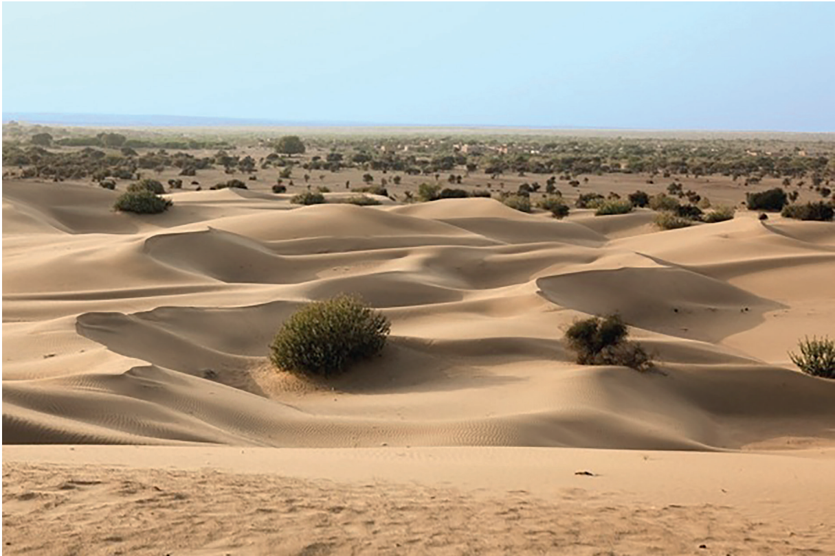
Fig. 2.2 for Question 2