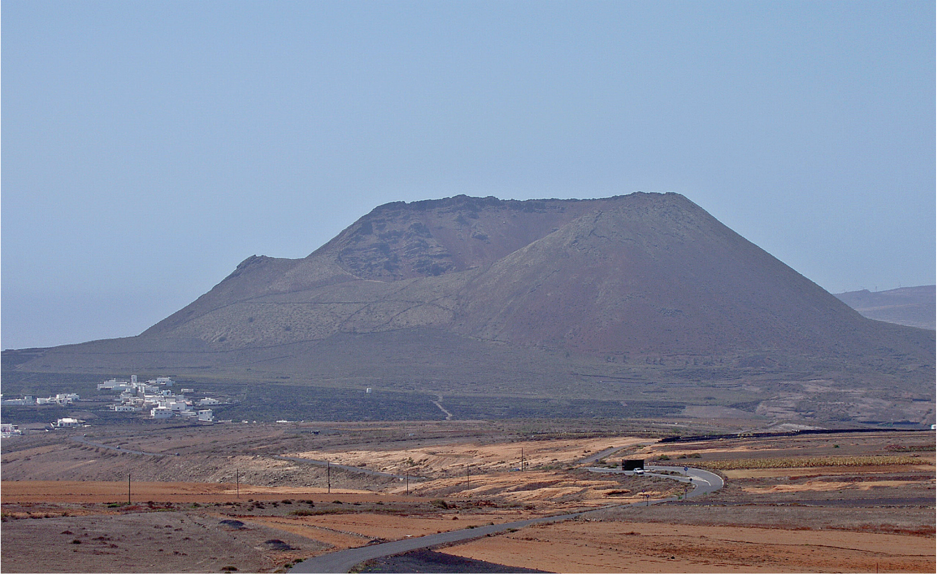
Fig. 2.1 for Question 2