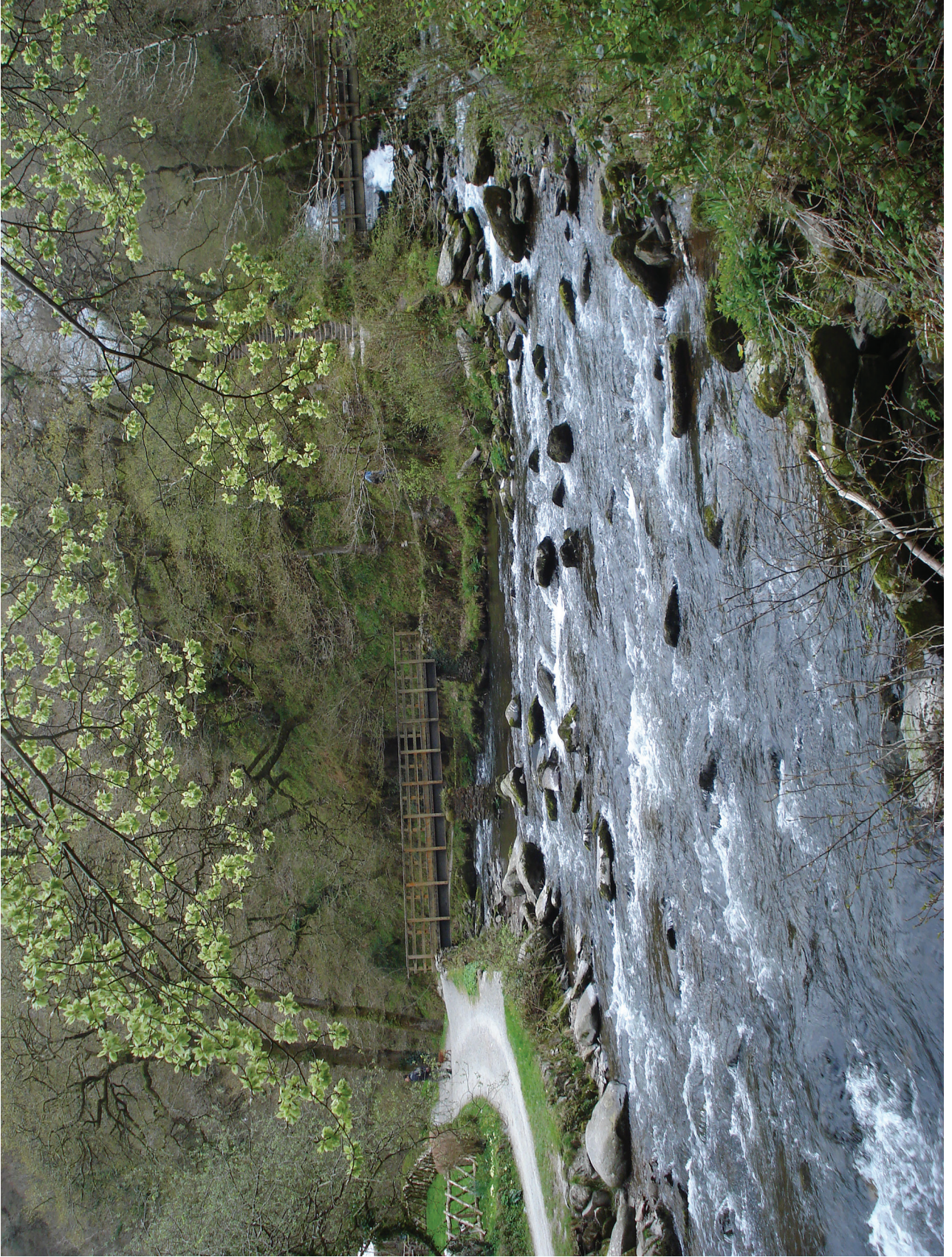
Fig. 3.1 for Question 3