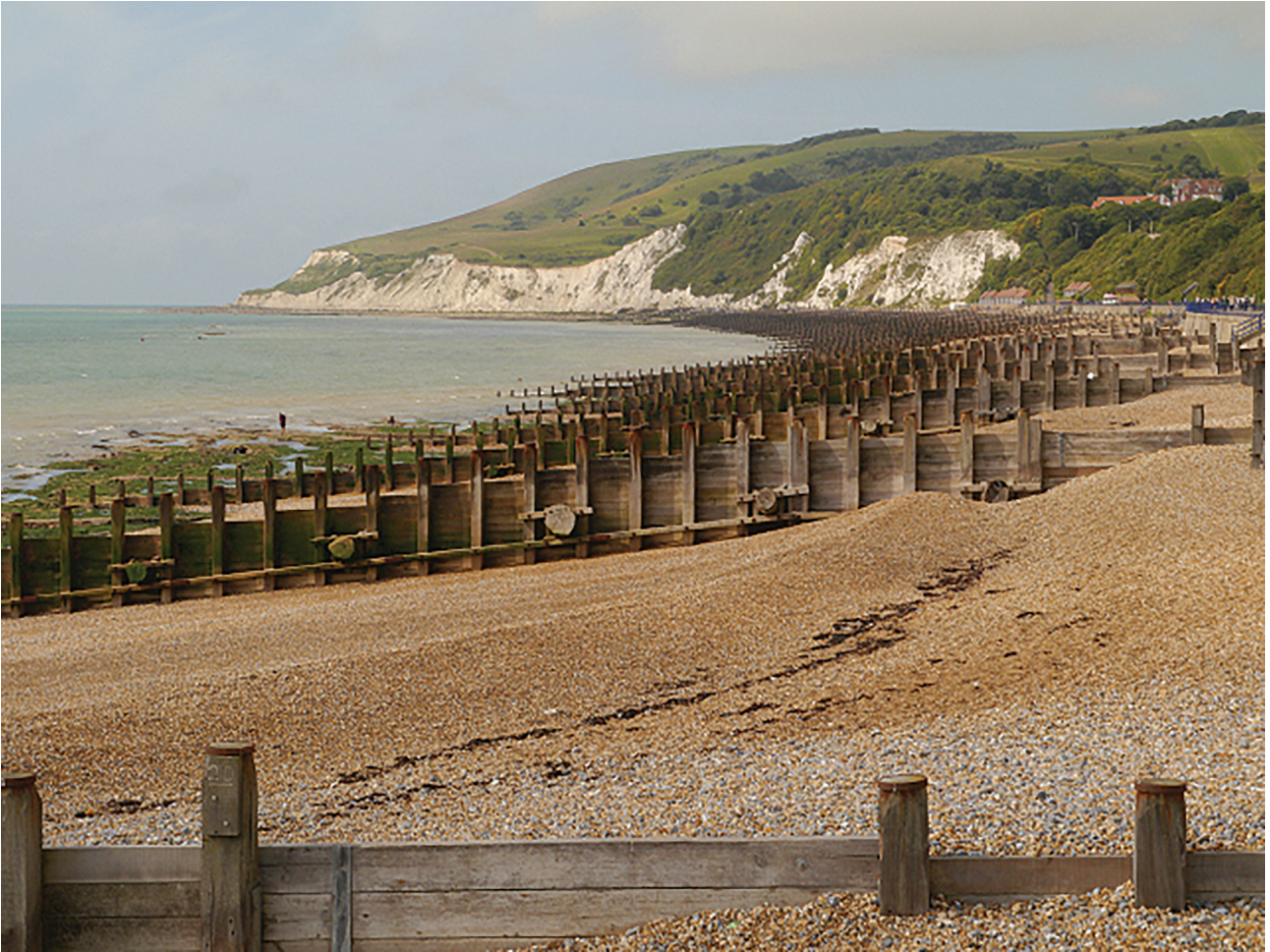
Beach where students did fieldwork