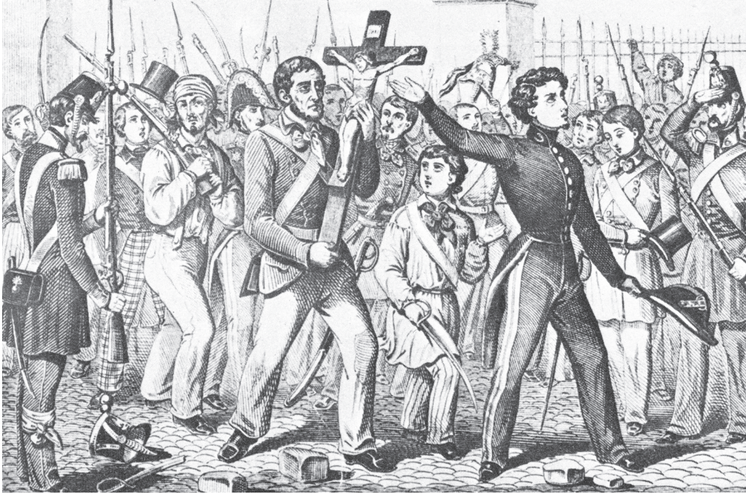
A drawing from the time of protestors on 24 February 1848, rescuing a crucifix from the Tuileries and taking it to the church of Saint-Roch.