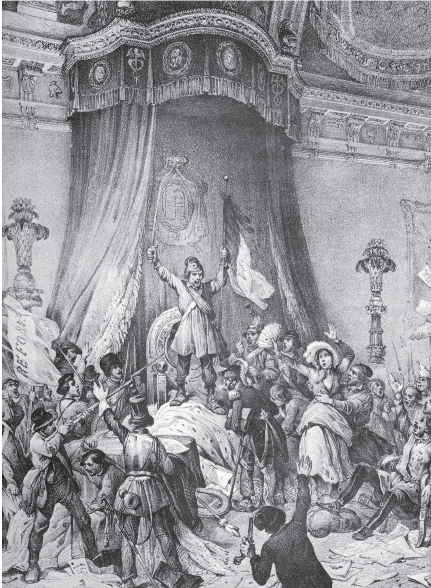
A drawing from the time of the throne room in the Tuileries, Louis Philippe's palace, 24 February 1848.