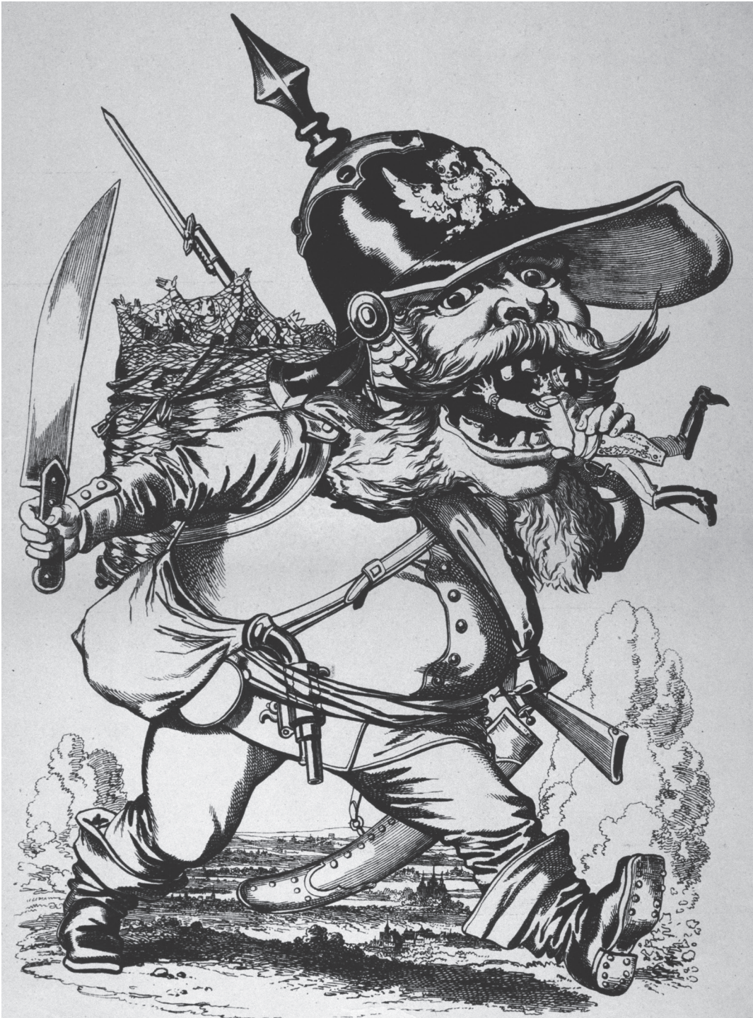
A French cartoon of King William I and the princes of northern Germany, 1867.