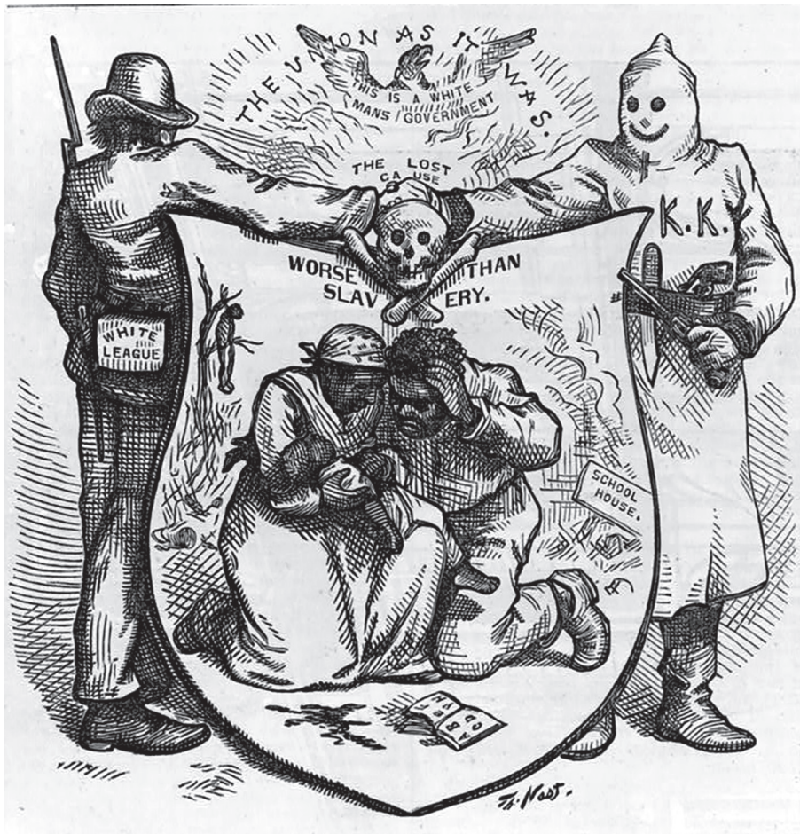
A cartoon published in an American magazine, October 1874.