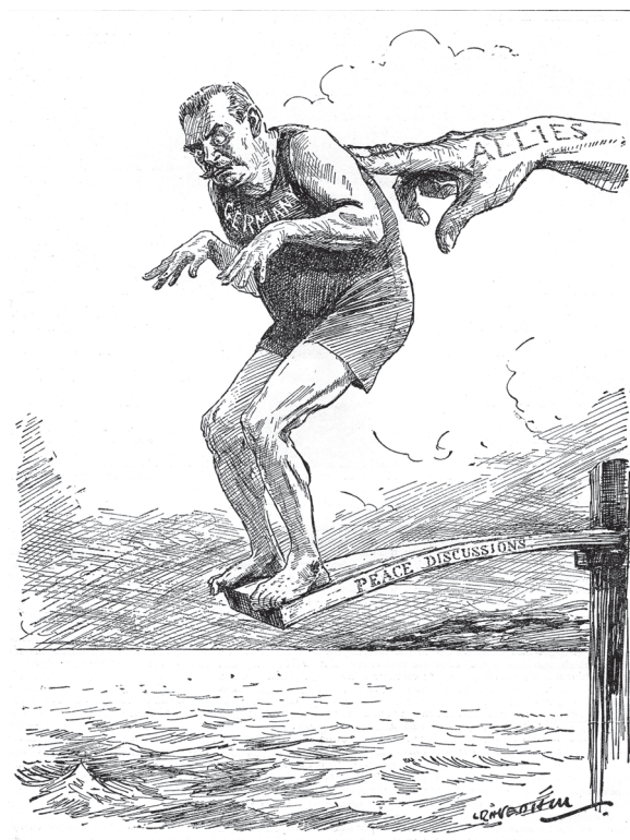
THE FINISHING TOUCH.

A cartoon published in a British magazine, June 1919. The words on the plank say 'Peace discussions'.