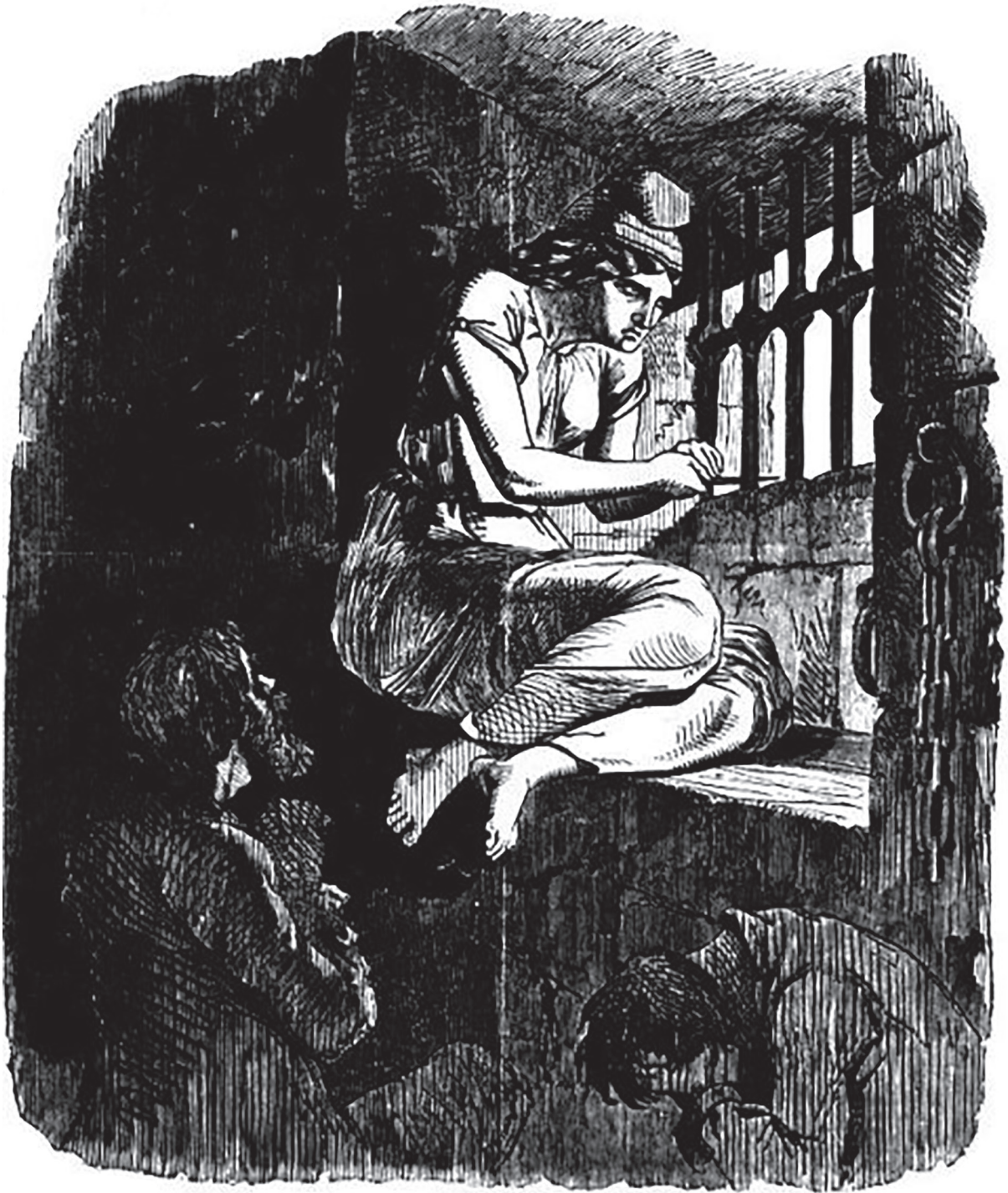
An illustration published in a British magazine, September 1856. It is entitled 'Liberty files the Austrian Bars of Italy.' 'Files' means cuts away.