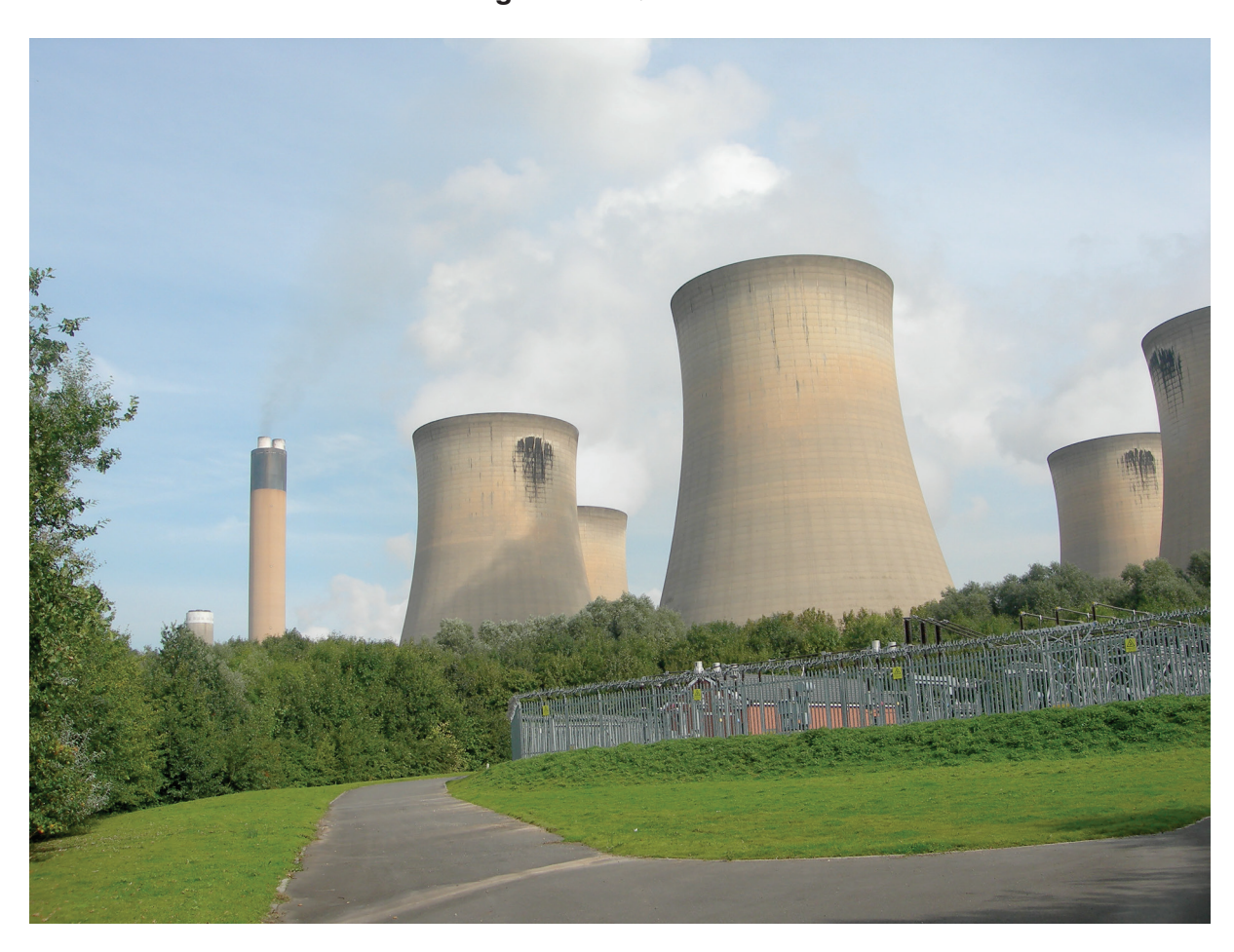
Fig. 6.2 for Question 6