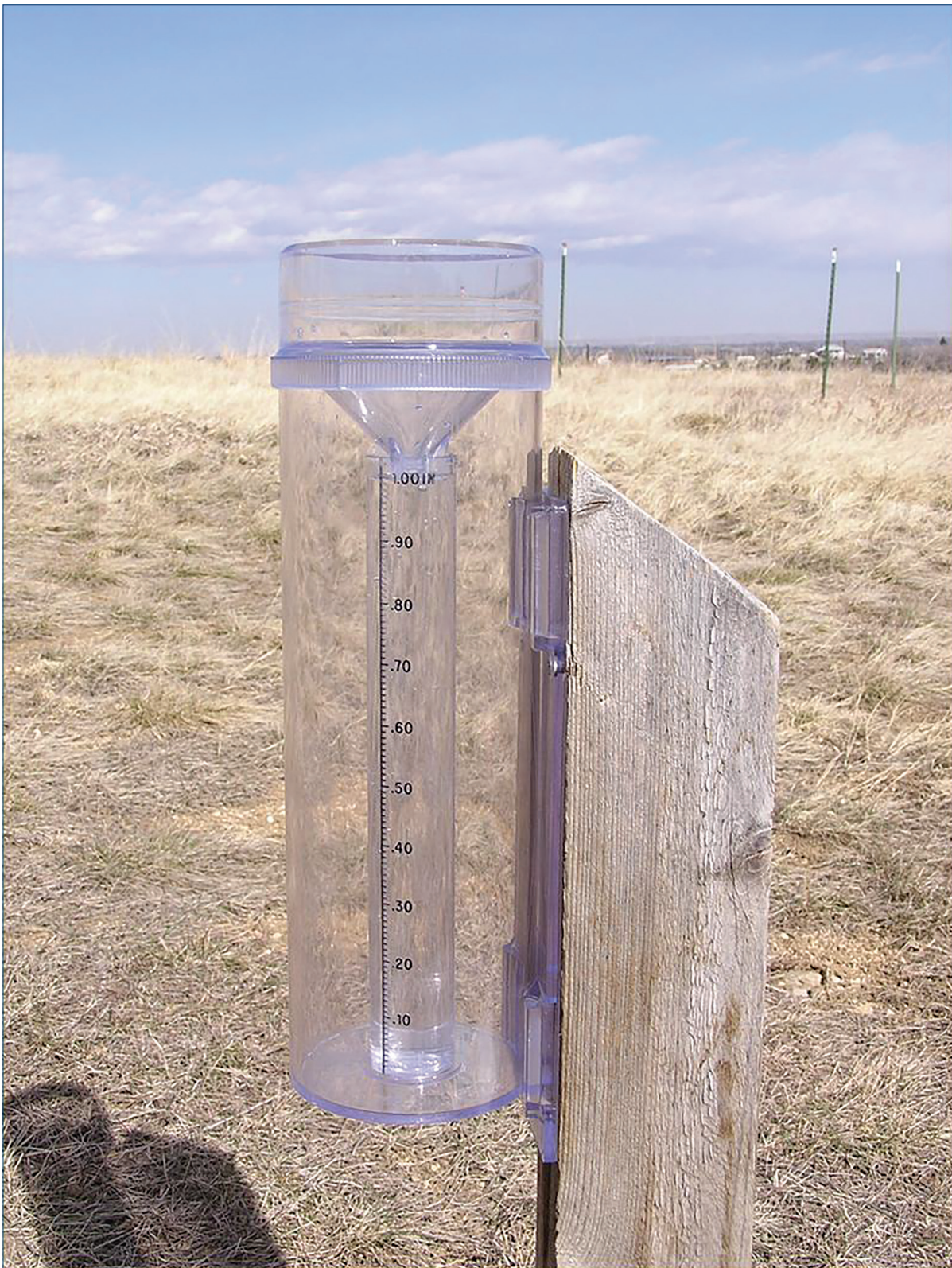
An instrument to measure rainfall