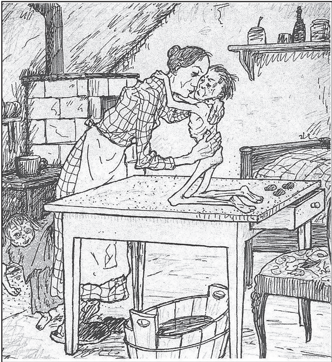
A cartoon entitled 'Consolation' published in a German magazine, 24 June 1919. The mother is saying to her child, 'When we have paid 100,000,000,000 marks, then I shall be able to give you something to eat.'