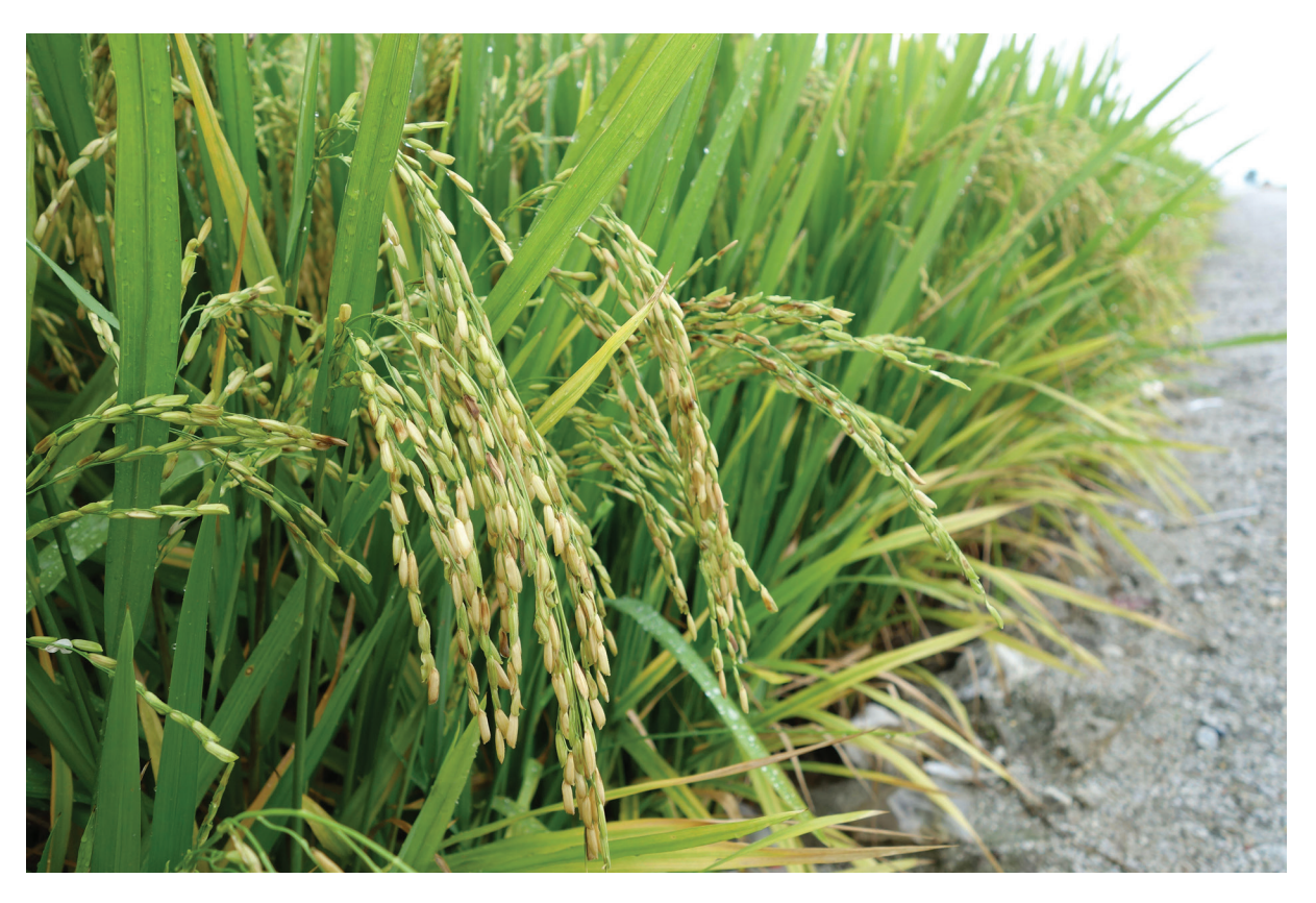
Fig. 3.2 for Question 3