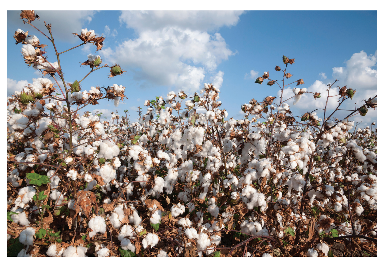
Fig. 3.4 for Question 3