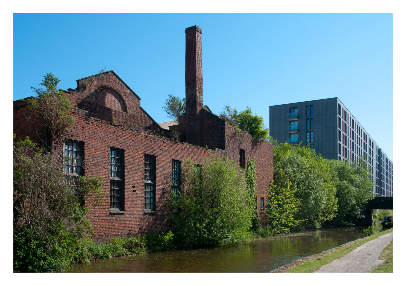
Fig. 10.1 for Question 10 A disused factory and new apartments in an area of Manchester, UK, an HIC in Europe