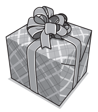
Fig. 2.1 Examples of wrapped gifts