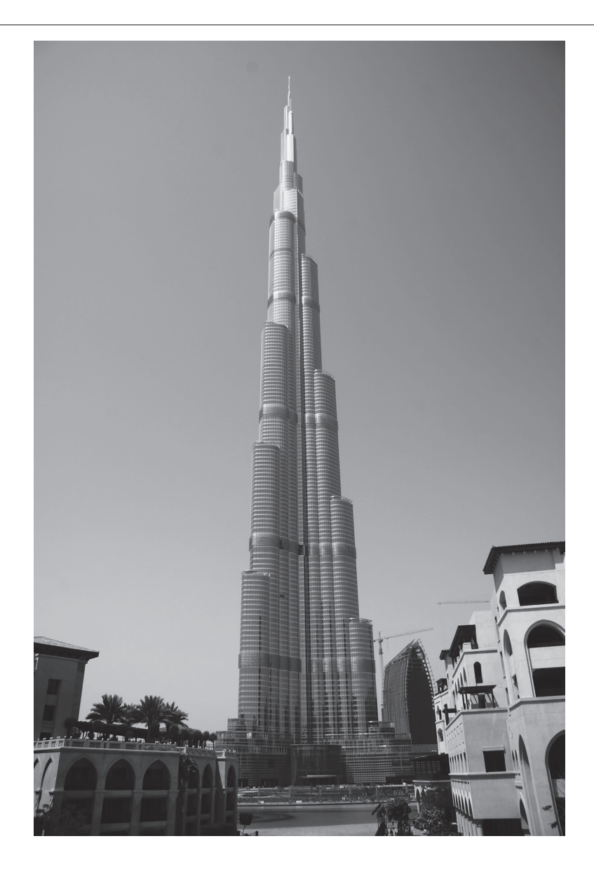
Fig. 1 for Question 1

The Burj Khalifa is a skyscraper in Dubai. It is the tallest structure in the world standing at over 800 metres. The Burj Khalifa is a recognised tourist attraction which has: