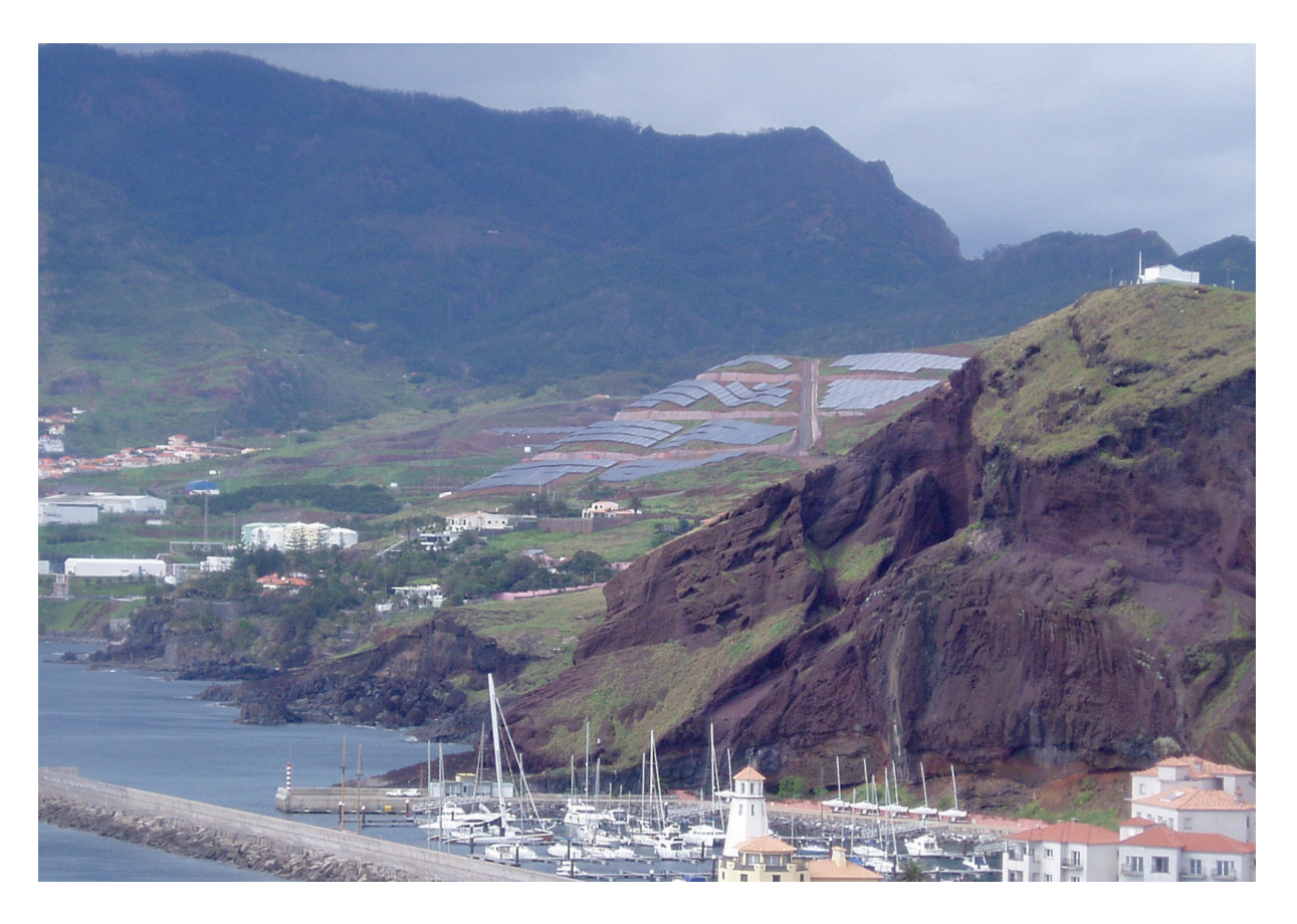
Photograph C for Question 6