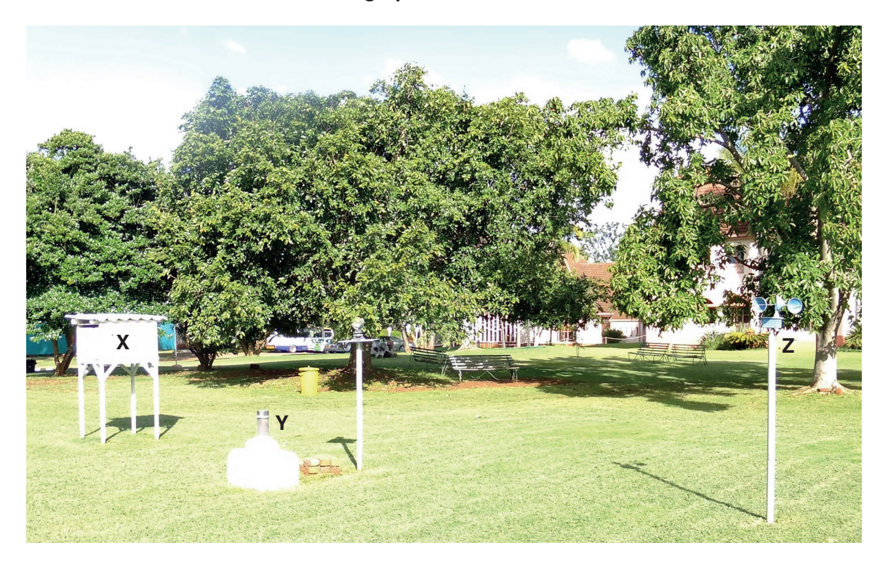
Photograph B for Question 4