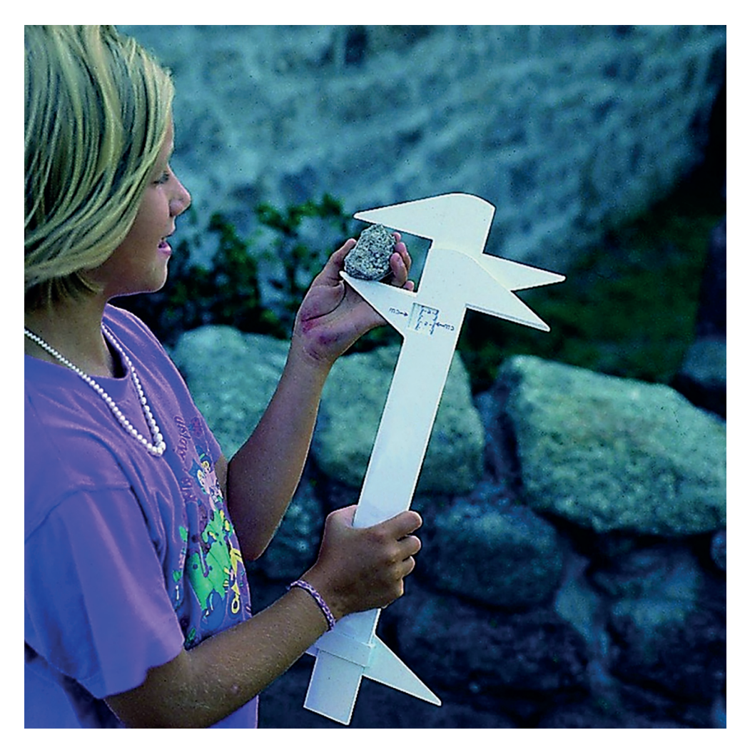
Fig. 1.4 for Question 1