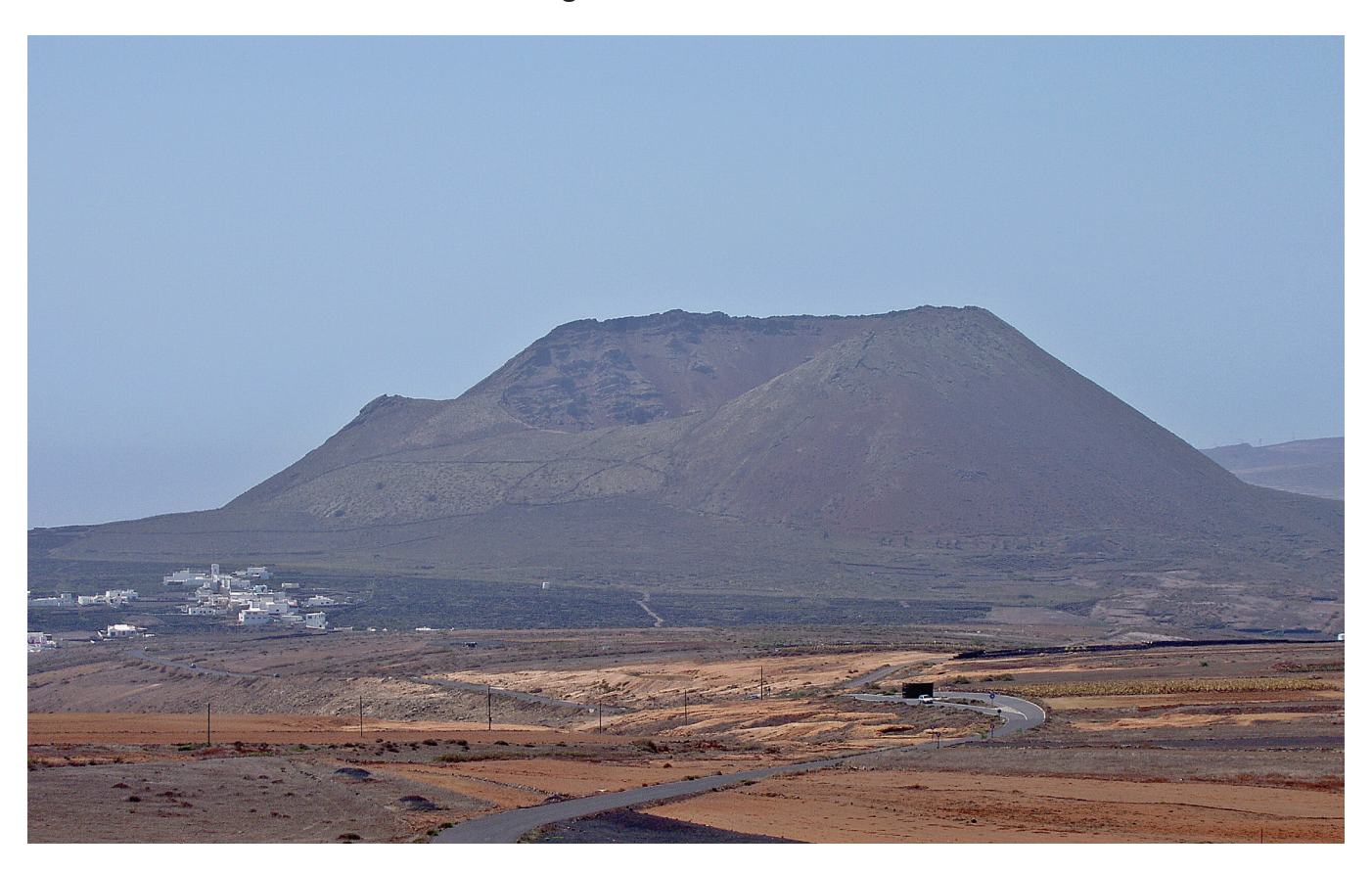
Fig. 2.1 for Question 2