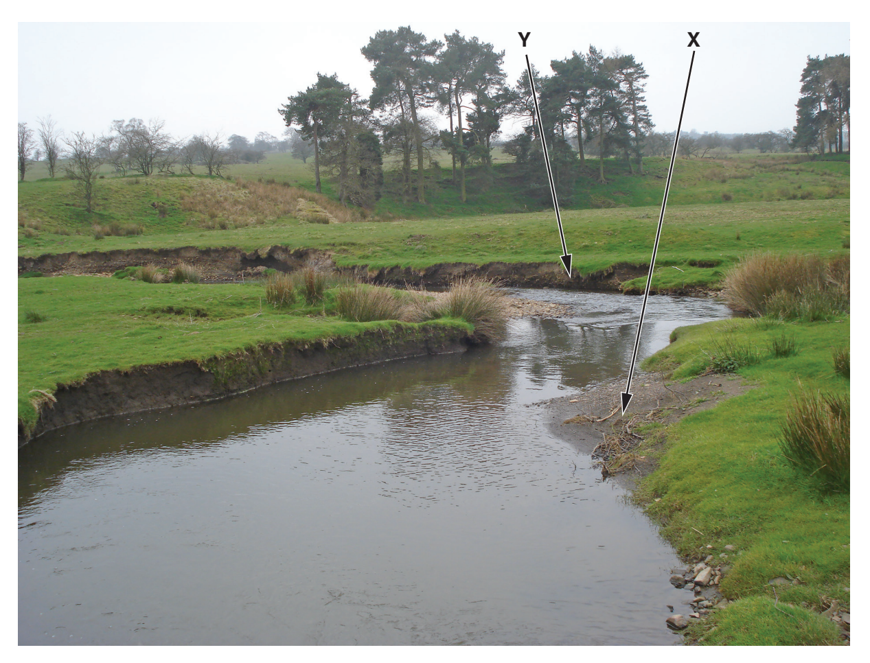
Fig. 4.1 for Question 4