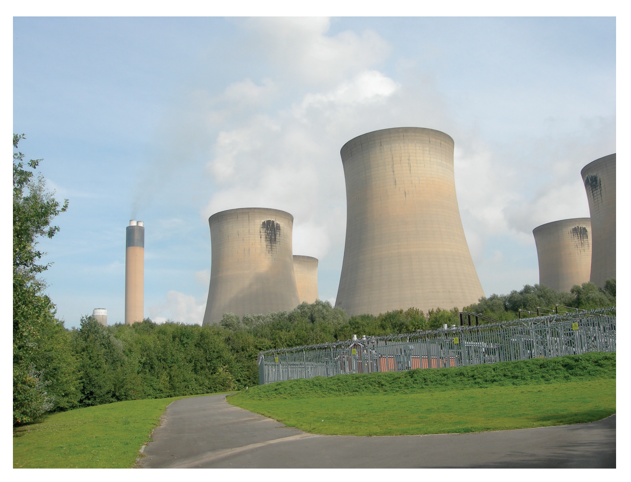
Fig. 6.2 for Question 6