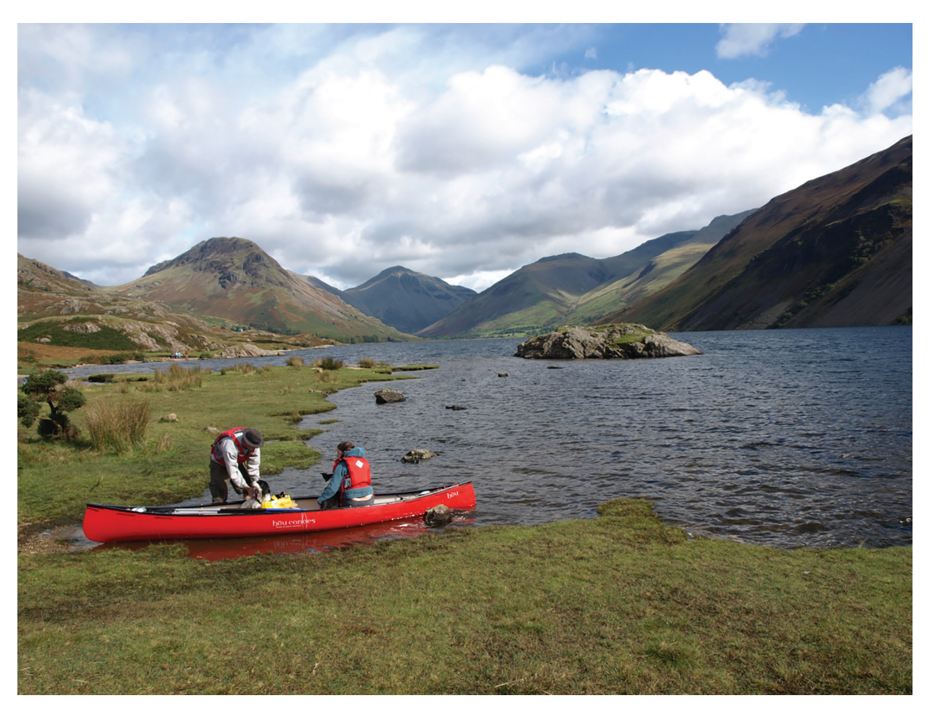
Fig. 6.2 for Question 6