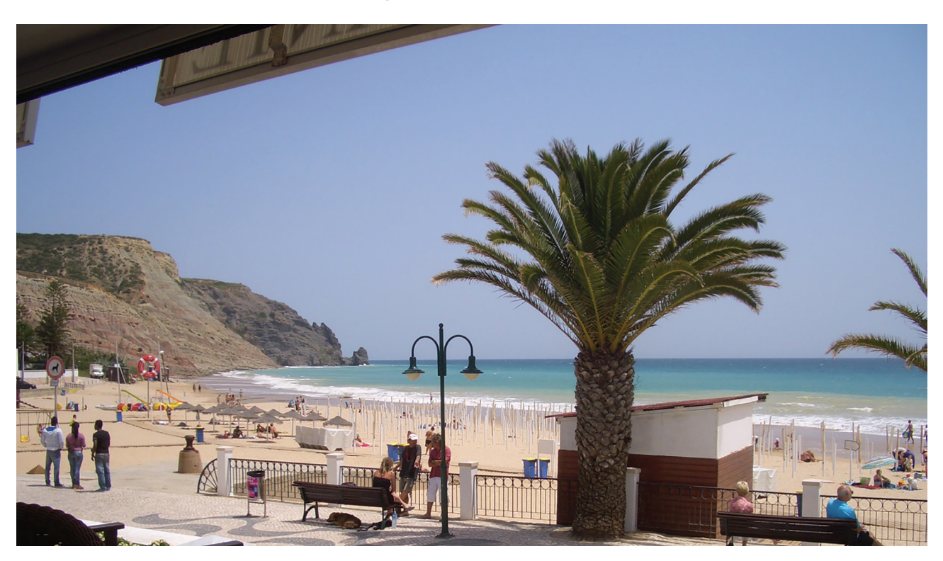
Fig. 2.2 for Question 2