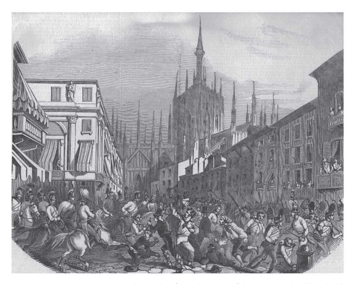
A drawing from the time of the uprising in Milan in March 1848.