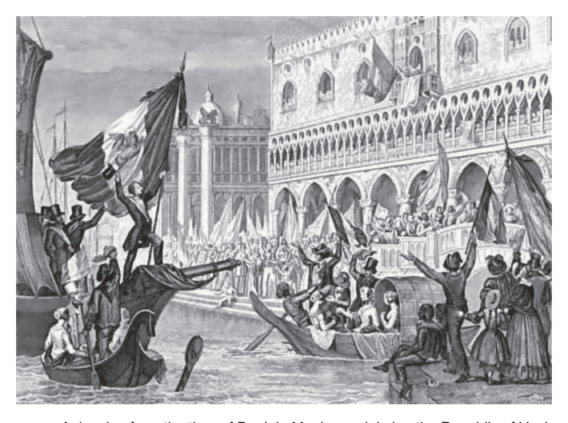
A drawing from the time of Daniele Manin proclaiming the Republic of Venice in 1848.