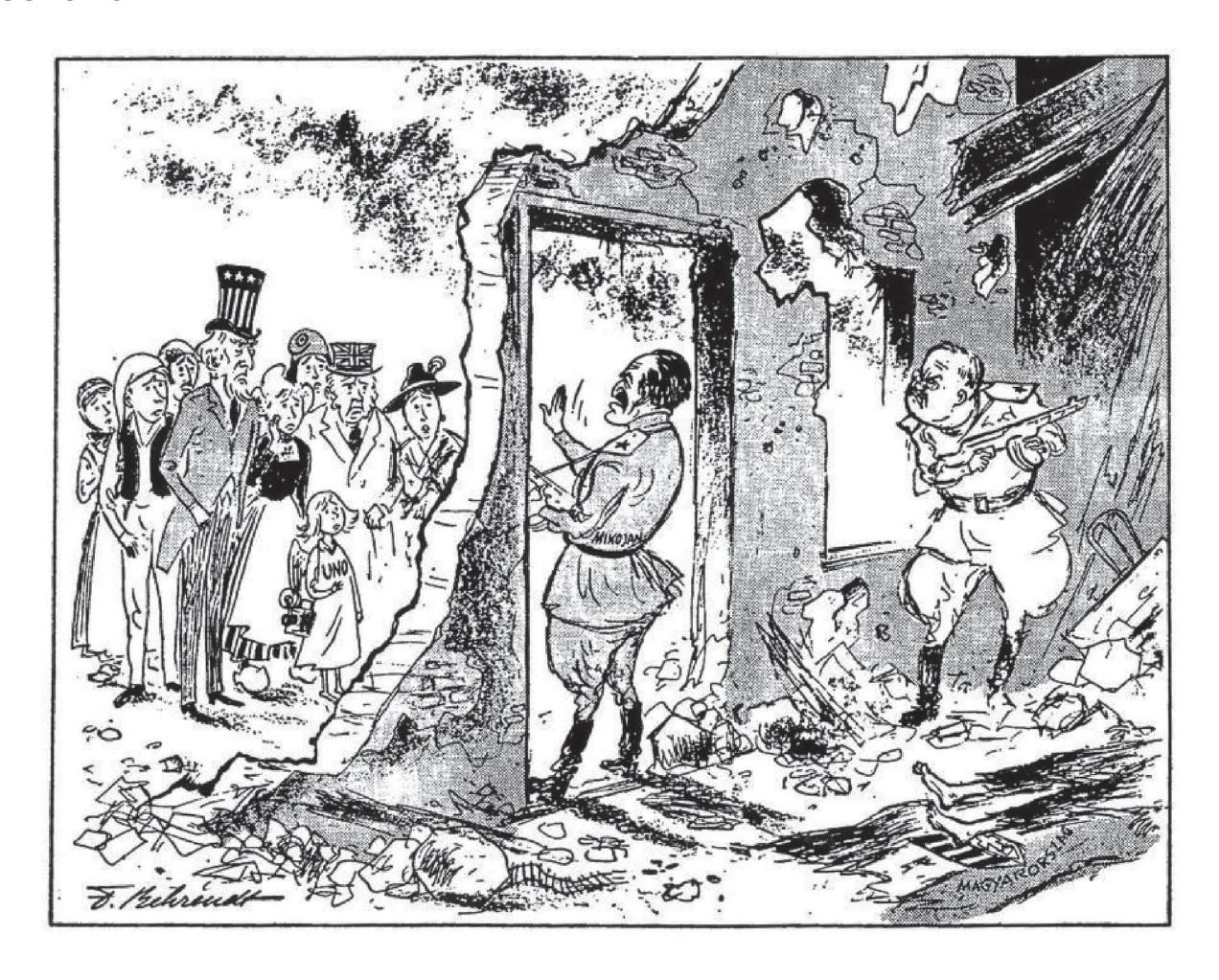
A cartoon published in Holland in November 1956. The Soviet soldier is saying 'This is a purely Hungarian matter.'