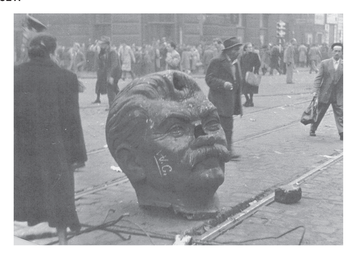
A photograph taken in Budapest, October 1956.