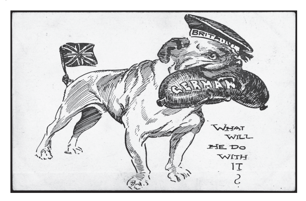
A British postcard, 1914.