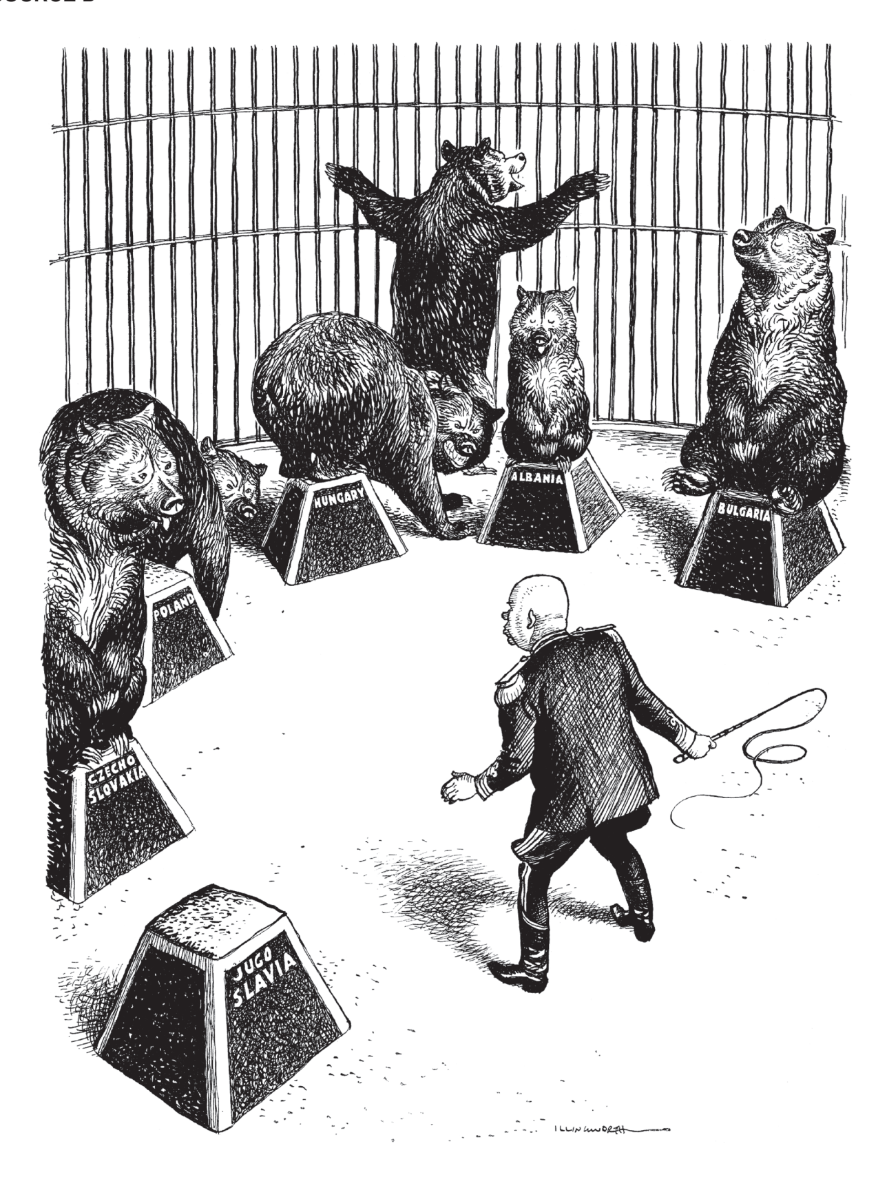
A British cartoon published on 31 October 1956. The figure with the whip is Khrushchev.