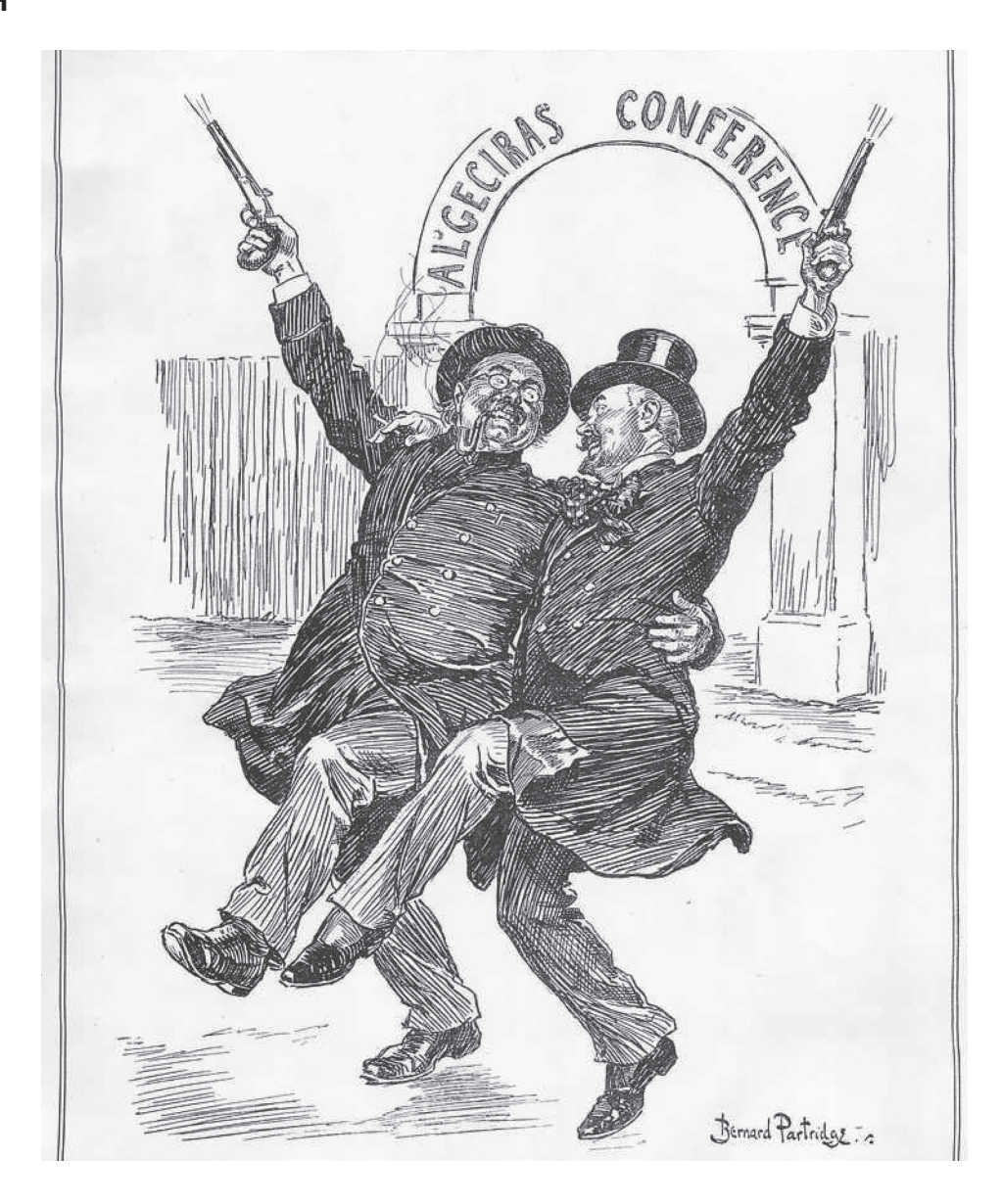
A British cartoon entitled 'Shots of Joy', published in April 1906. The caption to the cartoon read 'The Algeciras Conference has practically been concluded to the mutual satisfaction of the two rival powers whose differences at one time threatened to end in something worse than a diplomatic duel.'