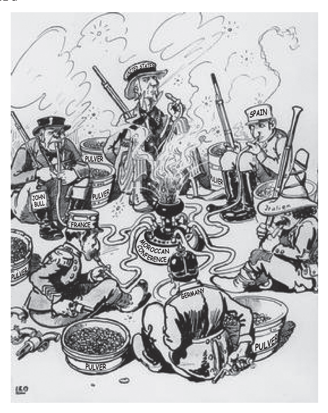
A German cartoon published in February 1906. The caption to the cartoon read 'At the Moroccan Conference: enthusiasm for smoking the peace pipe does not exclude the danger of a general explosion.' Pulver means gunpowder.