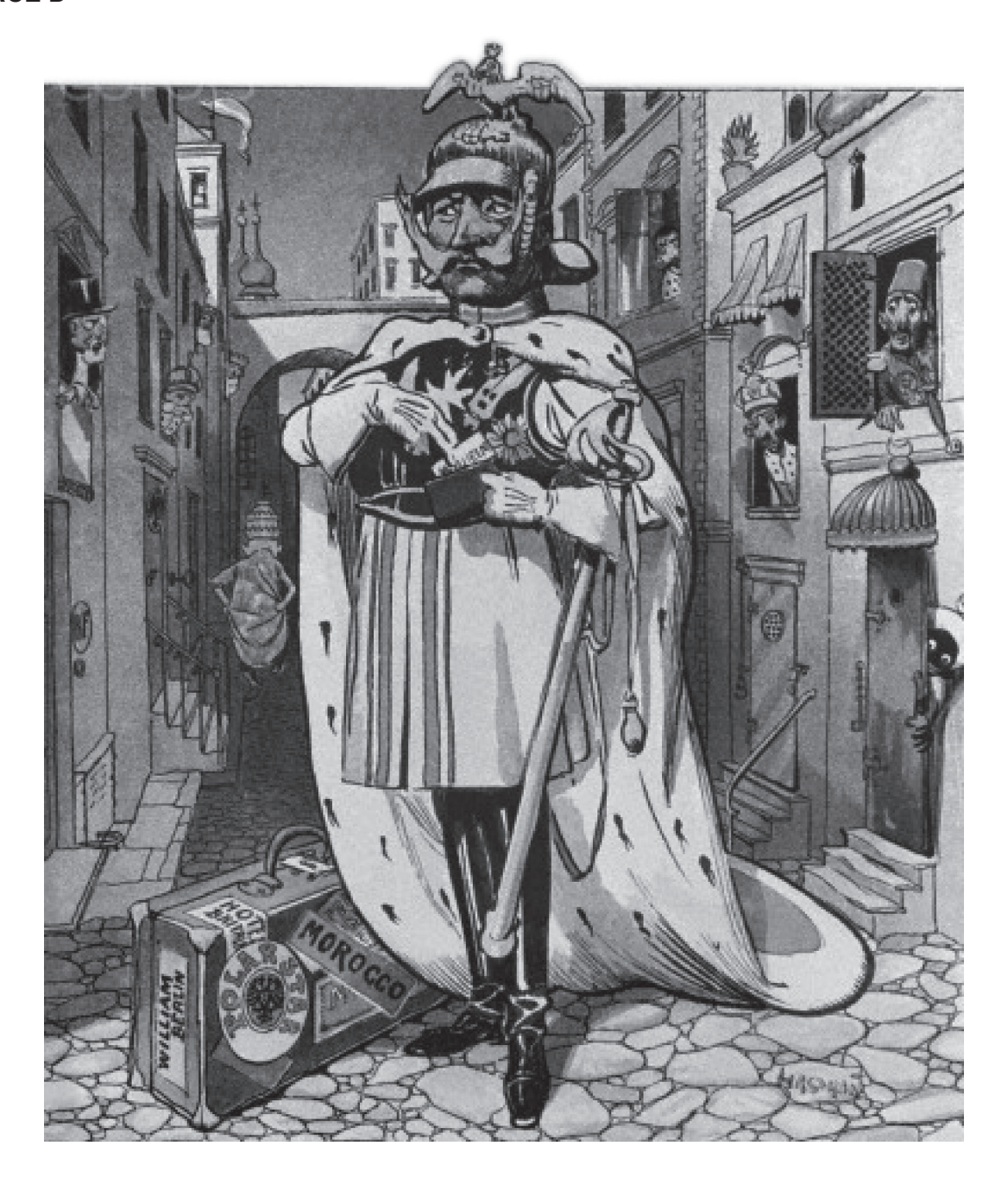
A British cartoon published in 1905. The caption to this cartoon read 'The Morocco Crisis: Let men see - whom shall I call on next?'