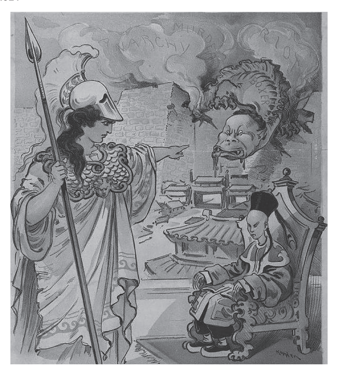
A cartoon published in an American magazine, August 1900. The caption reads 'The First Duty. Civilisation speaking to China: "That dragon must be killed before our relationship can be improved. If you don't do it, I shall have to."'