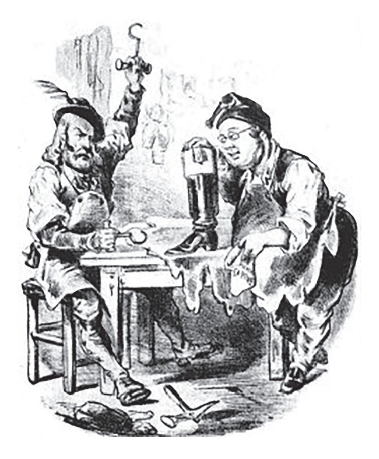
A cartoon from 1861 showing Cavour and Garibaldi making 'the boot' of Italy.