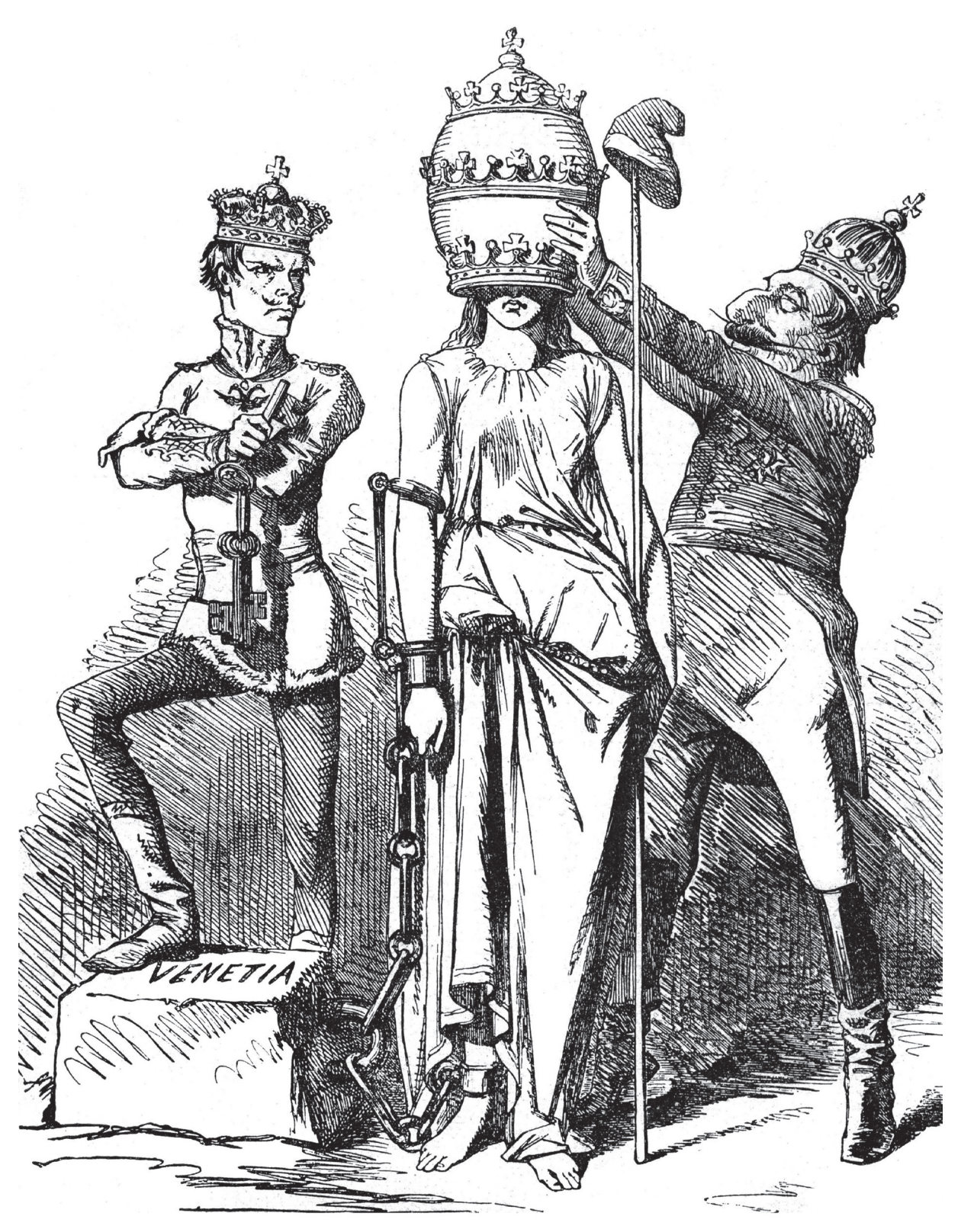
FREE ITALY (?)

A cartoon published in a British magazine in July 1859. The figures represent (left to right) Austria, Italy and Napoleon III. Italy is wearing the Papal crown.