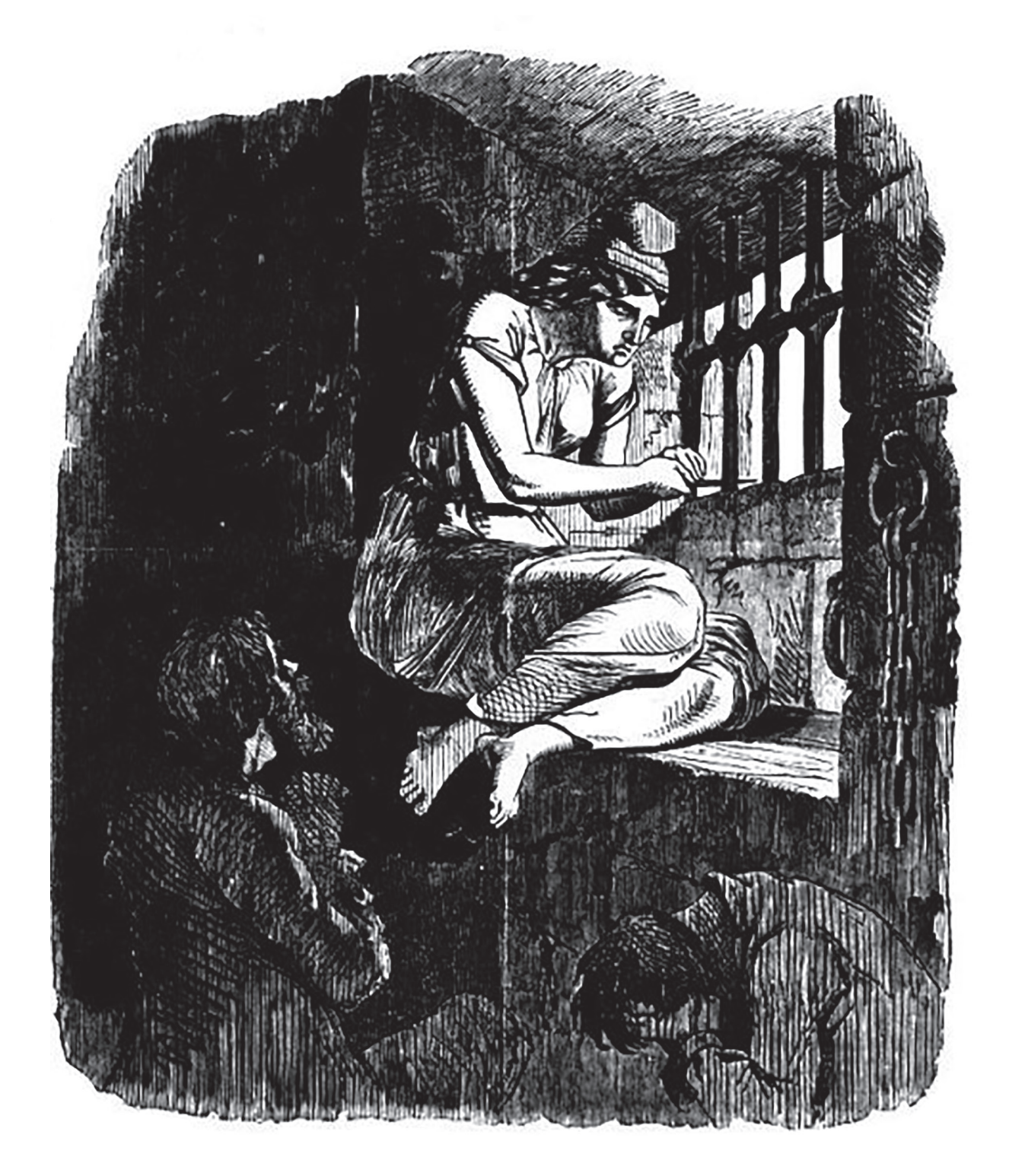
An illustration published in a British magazine, September 1856. It is entitled 'Liberty files the Austrian Bars of Italy.' 'Files' means cuts away.