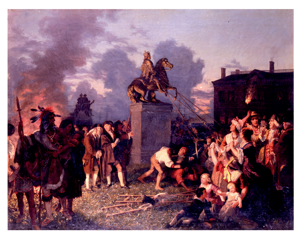
A painting showing the reactions of people in New York after the Declaration of Independence had been read out publicly, July 1776. The statue is of King George III.