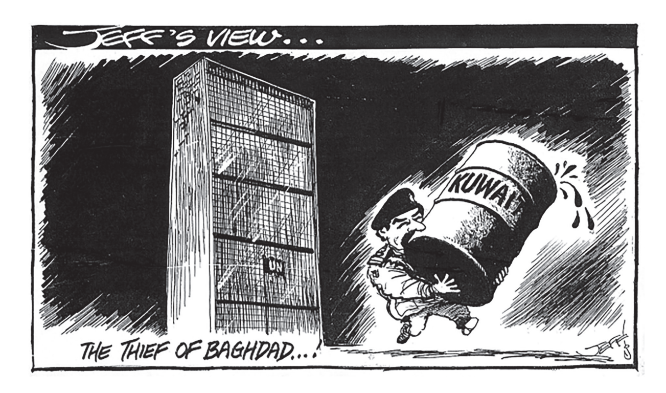
A cartoon published in Australia, 3 August 1990.