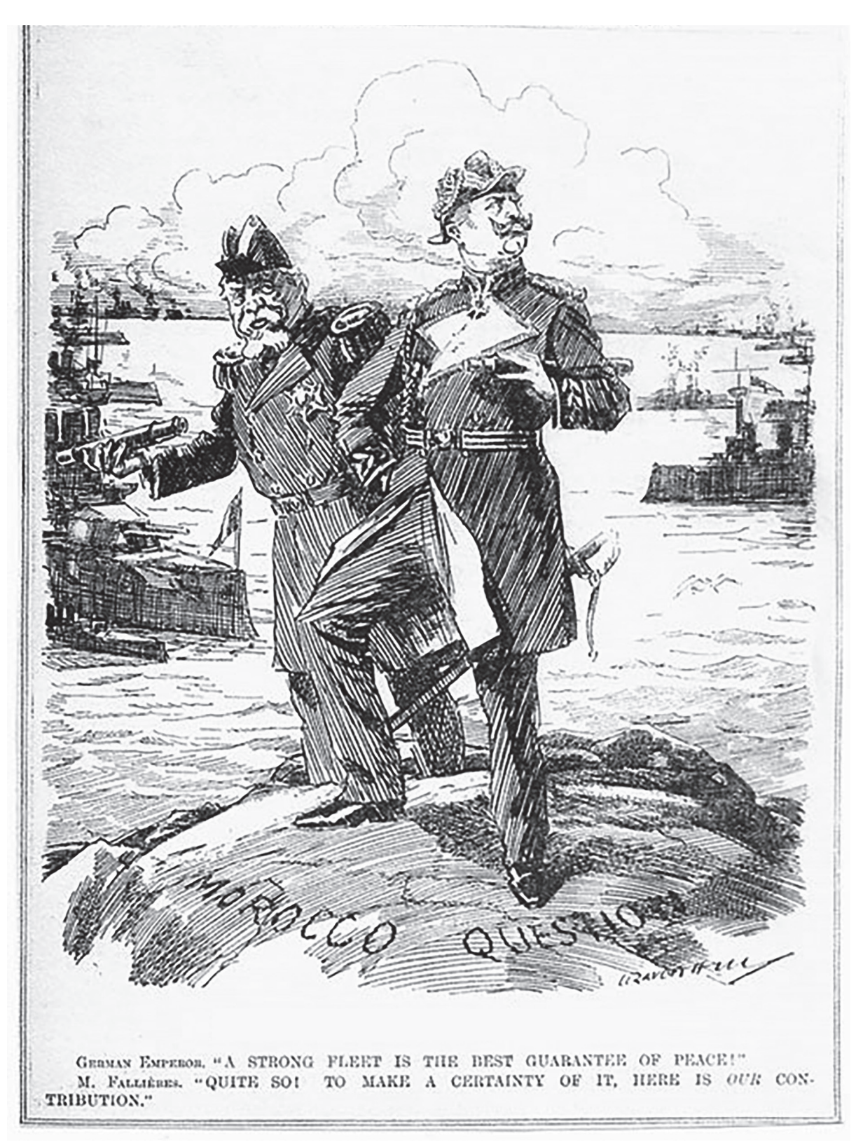
A British cartoon published on 12 September 1911. Fallières was President of France.