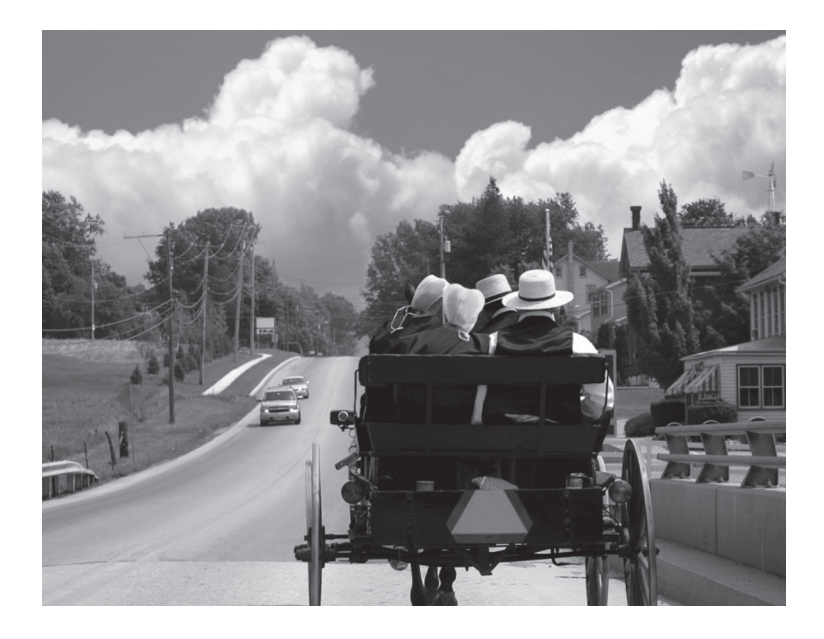
Image of the Amish travelling in a courting buggy on a road in Pennsylvania

The Amish are a religious community in Pennsylvania, USA. Their strict religious beliefs mean they reject some features of modern lifestyles, like the motor car. Individuals who do not conform to the norms of the group can face ostracism by their community. The Amish have become a tourist attraction because their way of life is so different. There can be conflict between them and the tourists as their religion means they are not happy to be photographed.