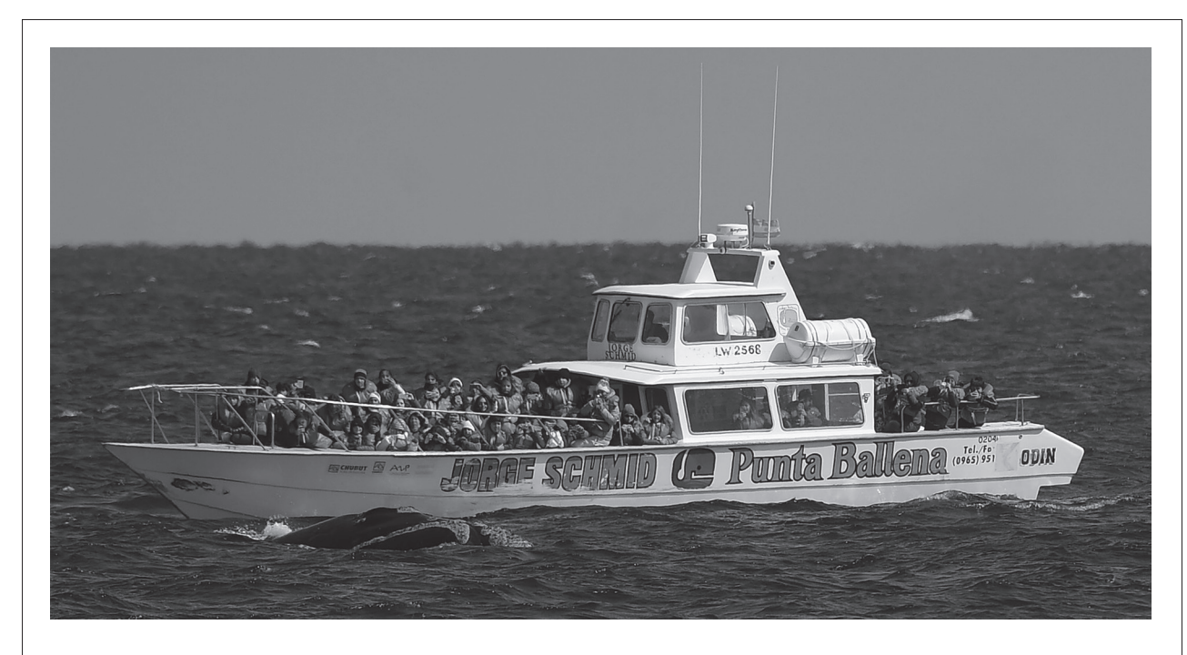
Fig. 3 for Question 3

Wildlife tours are popular with tourists. The photograph above shows a whale watching tour in Argentina.