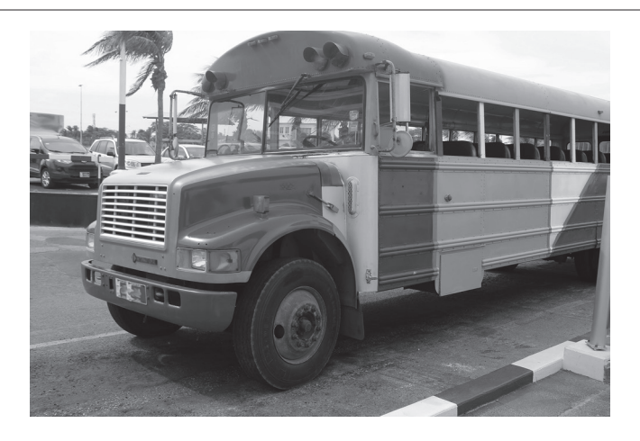
Fig. 2 for Question 2