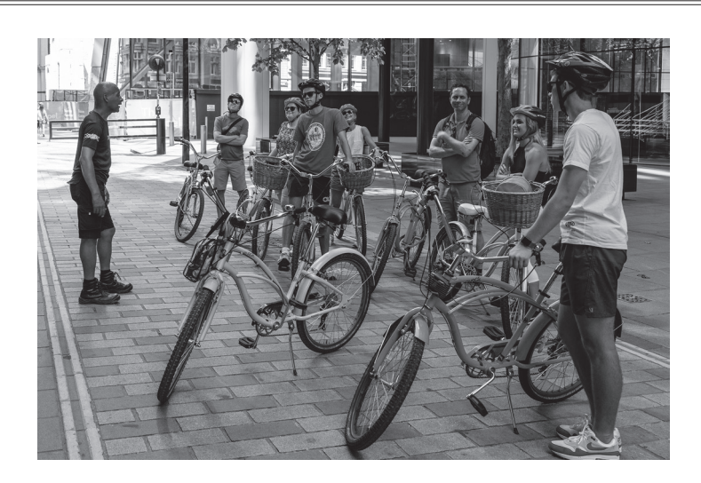
City Cycle Tours – Vancouver, Canada.